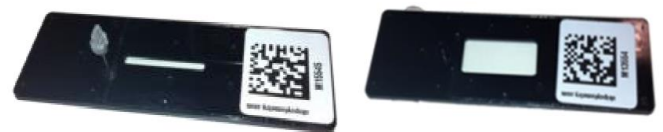
Figure 2: The ZellSafe™ Cell (left) + ZellSafe™ Rare (right) microfluidic biorepositories for long-term sample storage. Whereas ZellSafe™ Cell stores 250,000 cells, ZellSafe™ Rare stores about 1,000,000 cells for the investigation of rare events (<0.02%)

During conventional flow cytometry, the samples are lost with the flowing solution. One could split a sample and run several multiplex panels. But even after investing several months of lab work in panel development (e.g. four 8-plex assays), the number of potential biomarker candidates would still be limited. In ChipCytometry, the original samples are stored on small microfluidic chips, where they can be assayed over and over again (Fig. 2).