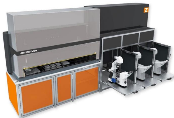
Figure 3: CytoBot™; ChipCytometry system for fully automated ChipCytometry analysis and data processing in 24/7 operation.

Overall, this study demonstrates that ChipCytometry is approximately twice as fast as flow cytometry and offers more design flexibility. At the beginning of a project, we use the manual system (ZellScanner ONE™) for its high flexibility and the possibility to immediately adapt the protocol to the new findings. Then, we use the fully automated ChipCytometry instrument (CYTOBOT™) to support the routine sample analyses of clinical trials (Fig. 3).